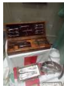
Don Beard’s surgical equipment